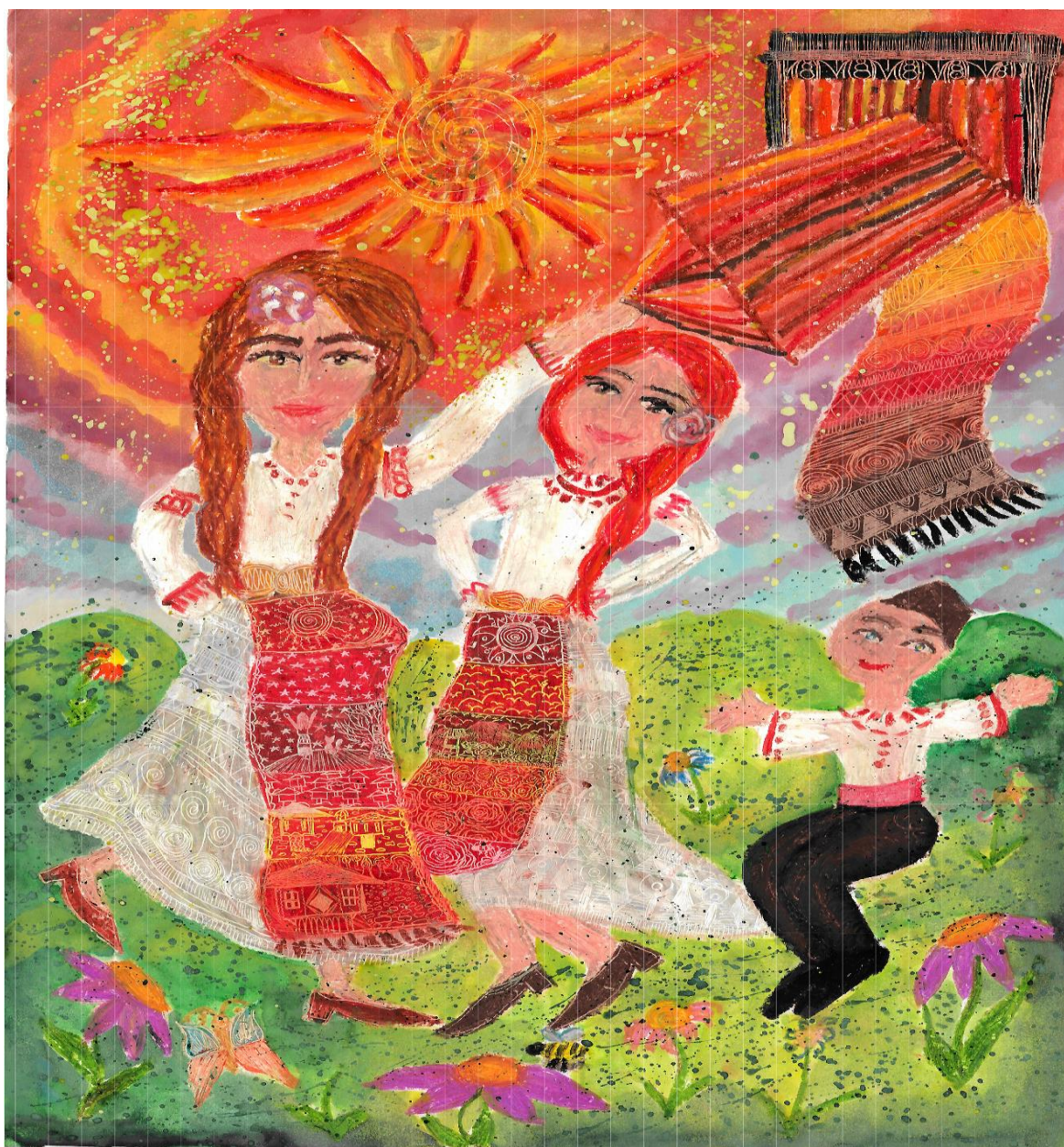
“With Bulgaria in the heart – Kavarna”, destination Kavarna